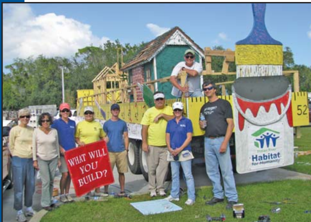
Above: A small but mighty crew of volunteers and staff, put our Christmas Parade float together in one day and created a fabulous presentation. Below: Staff, volunteers and homebuyer families shared circle-up prayer before the parade got under way.