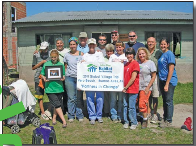
Above: Our 10-person team joins family members on a build site during the 2011 Global Village build in Argentina.